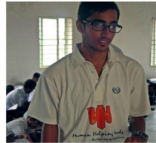
UJJWAL SANCHETI PUBLIC RELATIONS