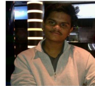
SAI AKASH HUMAN RESOURCES