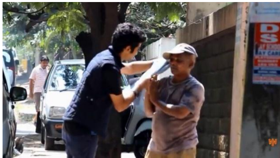
These are few snap shots of the videos we made for spreading awareness and happiness among the people.

Now a days the best way to reach more and more people is internet so we at Human Helping Hands thought we can educate and create awareness among people through some online tools like YouTube and blogs. We made few clips which encourage people to come out and help others who are in need and then we made videos about children education and child labor to create awareness among public which has reached more than 1000 people through our Facebook page. We look forward to keep up these works and make many more videos.