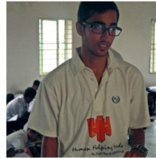
UJJWAL SANCHETI PUBLIC RELATIONS