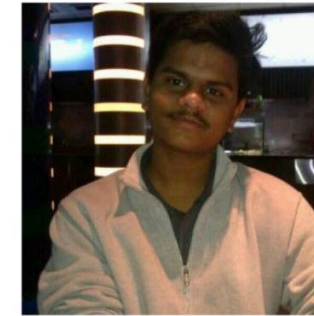
SAI AKASH HUMAN RESOURCES